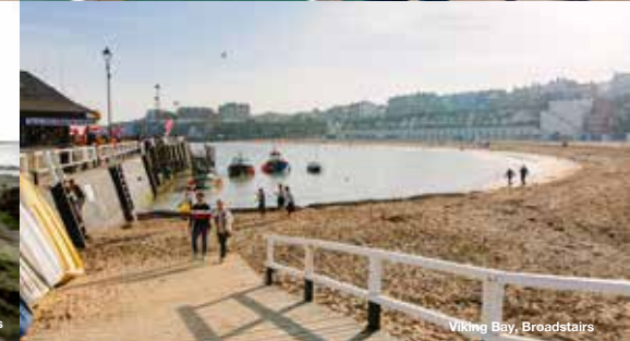
Viking Bay, Broadstairs