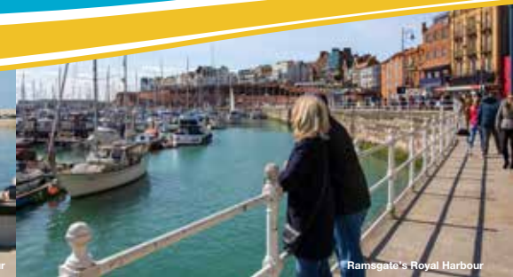
Ramsgate's Royal Harbour